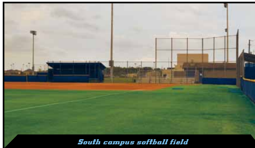
South campus softball field

SAN JACINTO COLLEGE Your Goals. Your College.