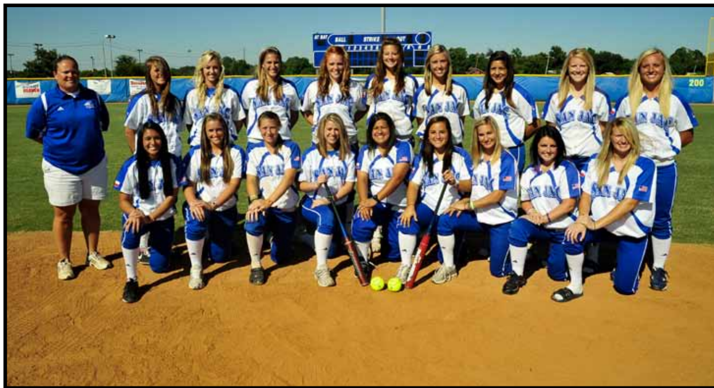
2011 softball team